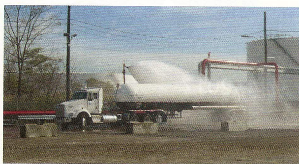
Figure 2. Butane offloading station.

material take-offs, miscellaneous lists and tabulations, schedules, as well as project cost budgeting and estimates. Having a thorough and detailed scope definition is important to solicit a lump sum firm price, and avoids change orders, which invariably adds cost and delays execution, in addition to causing misunderstanding and conflict.